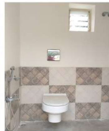
TATA STEEL LIMITED