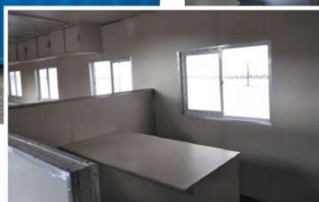
LARSEN & TOUBRO