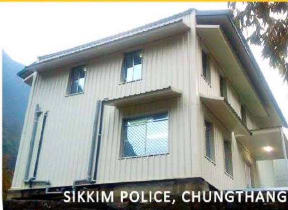
SIKKIM POLICE, CHUNGTHANG