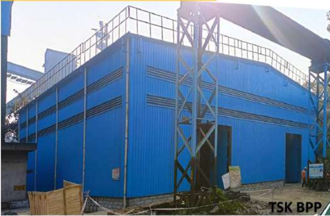
PEB FACTORY SHED