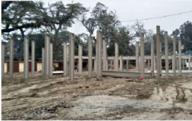
STRUCTURE ERECTION AFTER CIVIL FOUNDATION