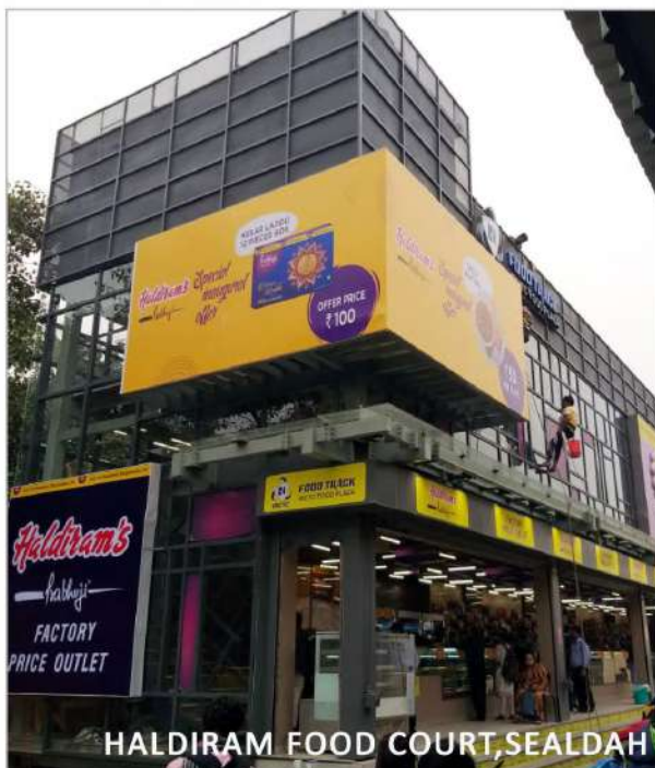
HALDIRAM FOOD COURT, SEALDAH