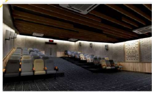
INTERIOR VIEWS - MAITREE MUSUEM