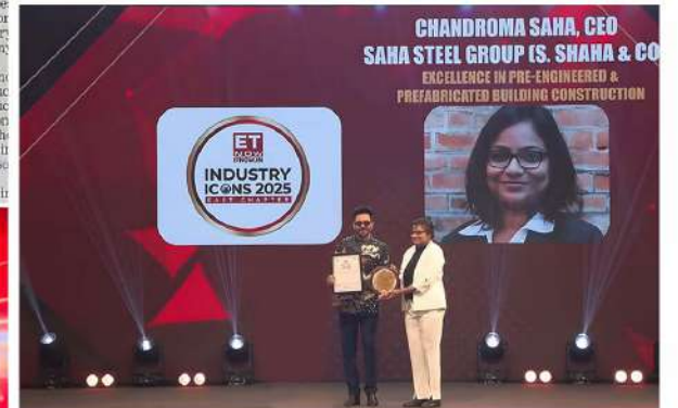
ET Now. In Industry Icons 2025 - East Chapter | Celebrating Business Excellence The Times Group hosted an evening of recognition and celebration on 31st January 2025 at JW Marriott, Kolkata, honouring distinguished leaders from the corporate world and the education sector for their remarkable contributions to Eastern India.

Industries. I believe in empower of women in Business so that they can also explore their skills and creativity. Her significant achievement is Successful completion of 20 schools within 90 days across 24 location, for Government of Odisha. Successful completion of 50 homes for flood-affected families in Kashmir in 90 days. Getting order of 87 buildings from Military Engineering services and many more. We are responsible citizen of Planet and 30% of pollution is caused due to Construction. If we change the method of construction and make it green or sustainable construction. It will lesser the pollution. The best part is our ability to impact change in society by doing projects which have a social cause. Our aim is to spearhead 3D printing in