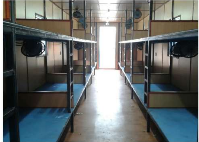
TITAGARH WAGONS LTD