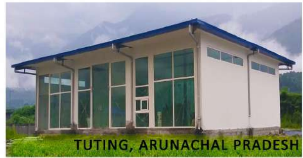
TUTING, ARUNACHAL PRADESH